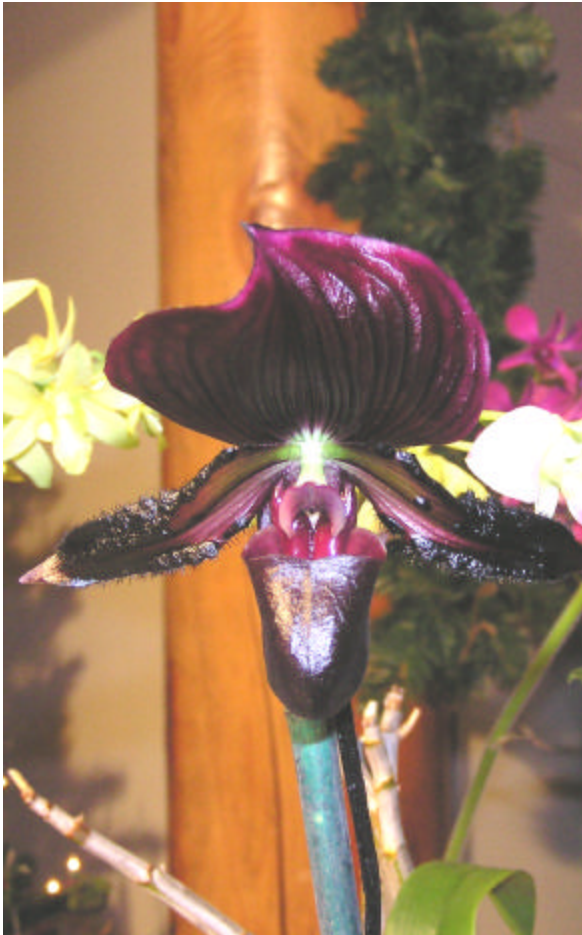
First Place Ribbon to: Paphiopedilum Black Stallion x Paph Magic Flame grown by Jaimie Graff