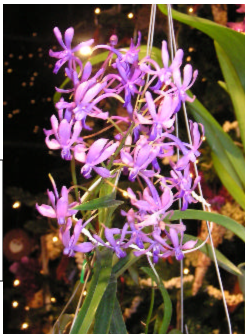
Second Place Ribbon to: Neofinetia Lou Sneary grown by Judith Goldstein