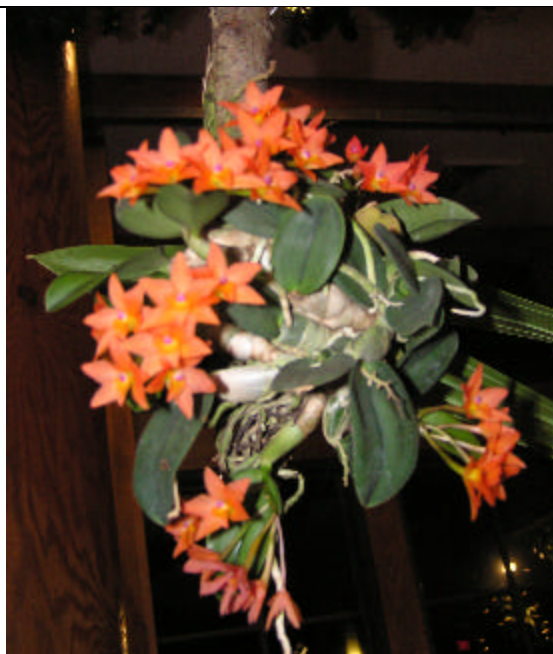
First Place Ribbon to Sophronitis cernua grown by Nick Plummer