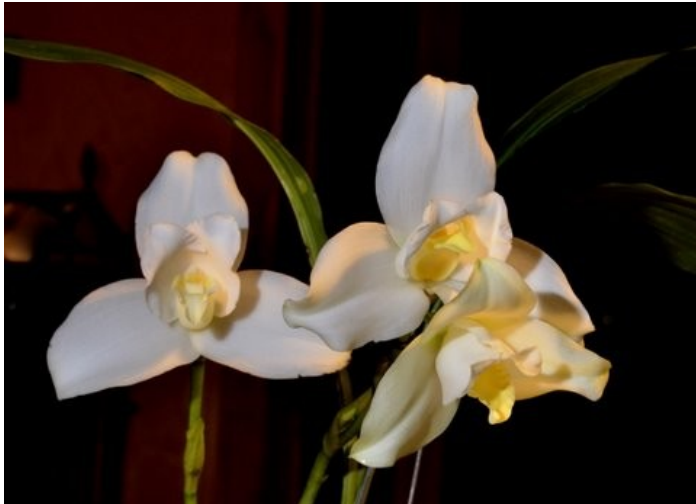
1 st Place Ribbon: Lycaste Malibu Canyon Grown by Mildred Howell