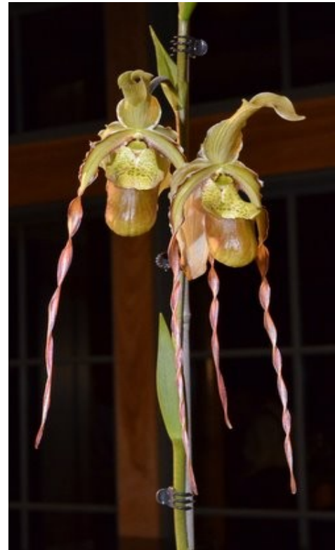
2 nd Place Ribbon: Phrag. caudatum Grown by Noland Newton