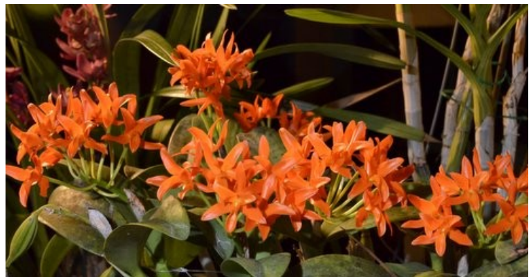
3 rd Place Ribbon: C. aurentiaca Grown by Nick Plummer