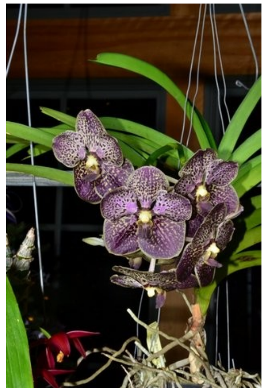
2 d Place Ribbon: V. Fuch's Delight "Black" Grown by Nick Burton