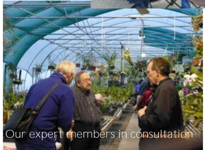
Our expert members in consultation