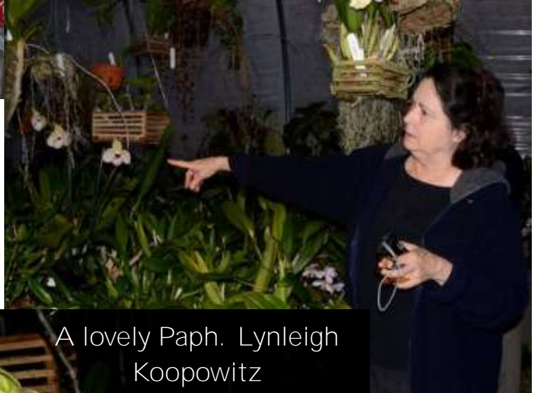
A lovely Paph. Lynleigh Koopowitz