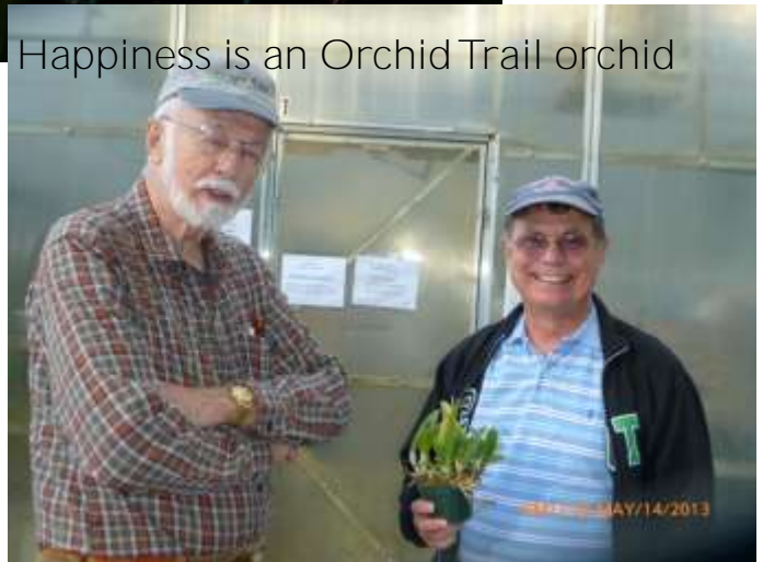
Happiness is an Orchid Trail orchid