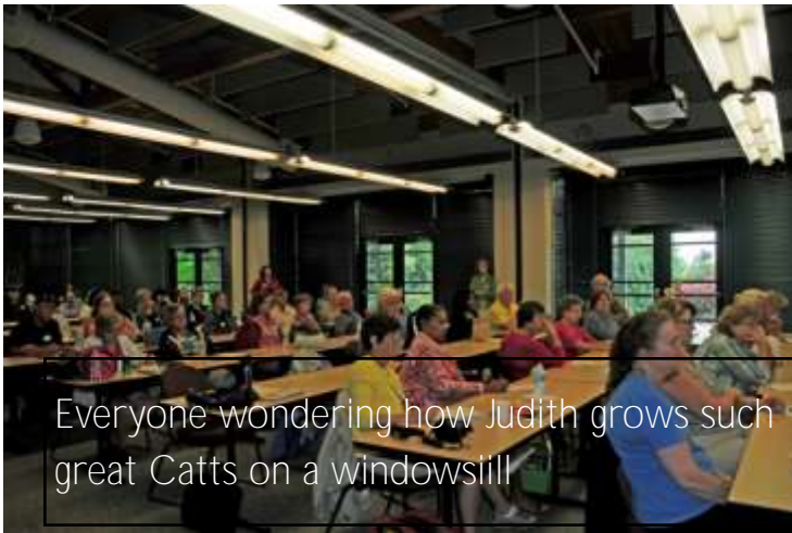
Everyone wondering how Judith grows such great Cattis on a windowsill