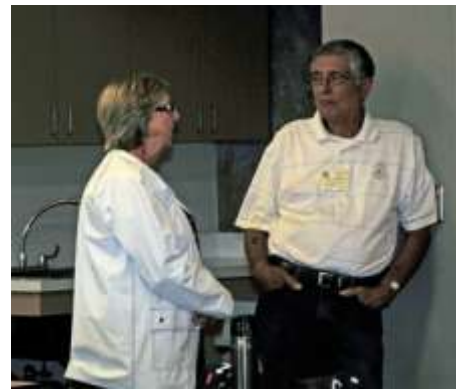
Harry setting some record straight