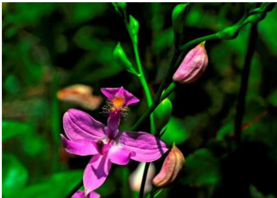
Calopogon barbatus (just thinking of summer!)