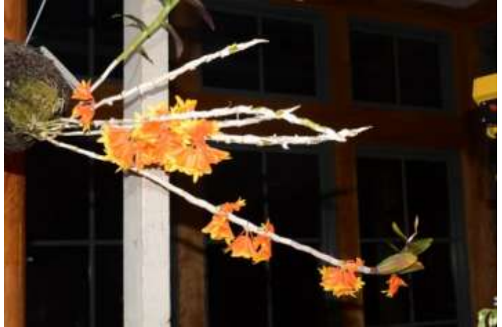
1 st Place Ribbon: Dendrobium chrysopterum Grown by Paul Feaver