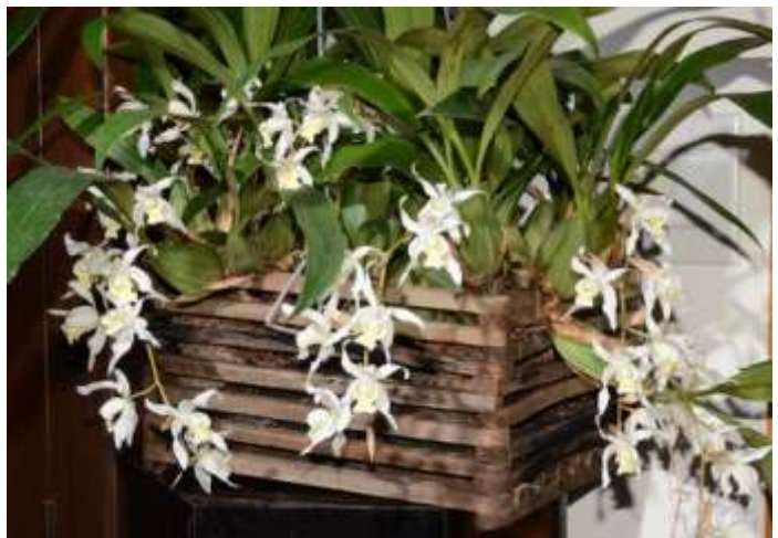
3 d Place Ribbon: Coelogyne mossiae Grown by Alan Simpson