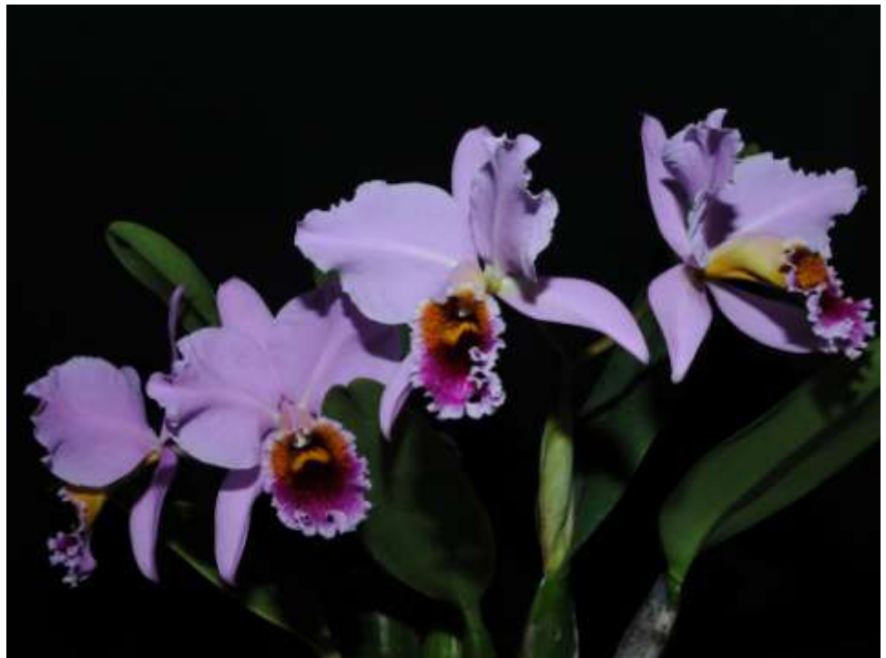
Cattleya percivaliana "Summit"

Map and directions To Sarah Duke Gardens.