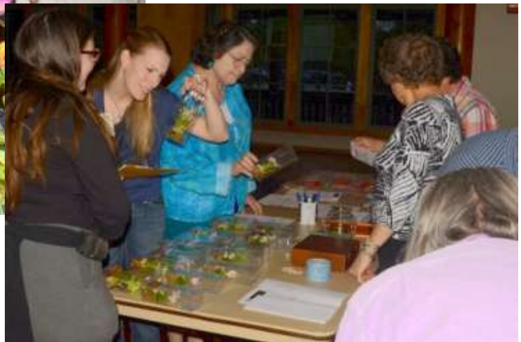
Membership meeting, April 2014