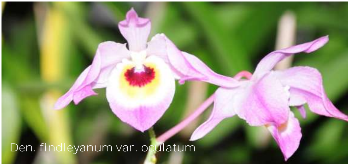
Den. findleyanum var. oculatum