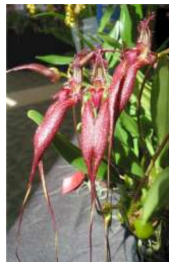
Bulbophyllum Doris Duke 'Bills Best' AM/AOS