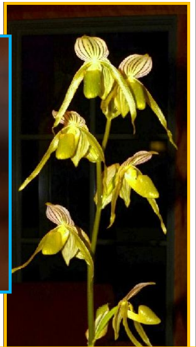
Paph kolopakingii x randsii_ TOS show table winner: Judi Powell