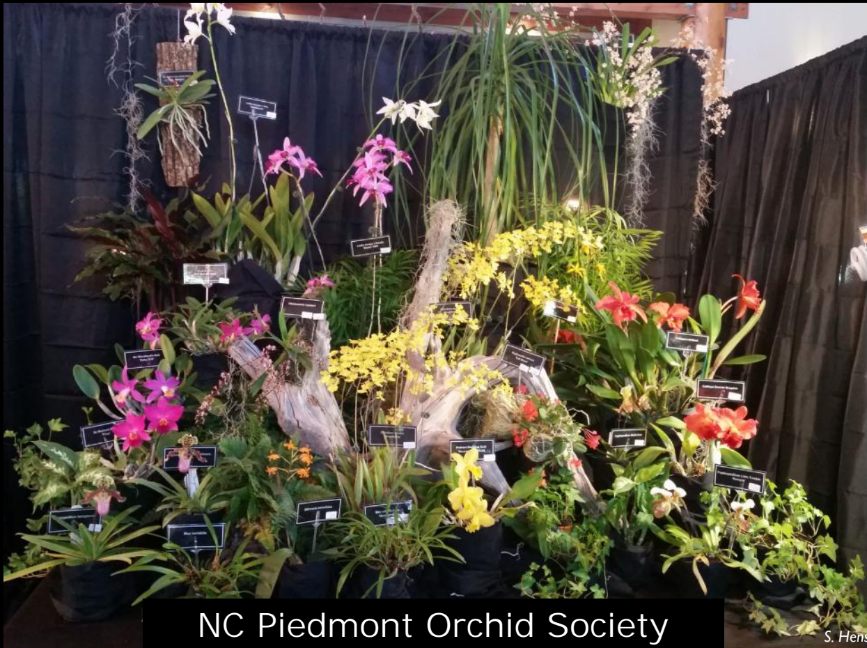
NC Piedmont Orchid Society