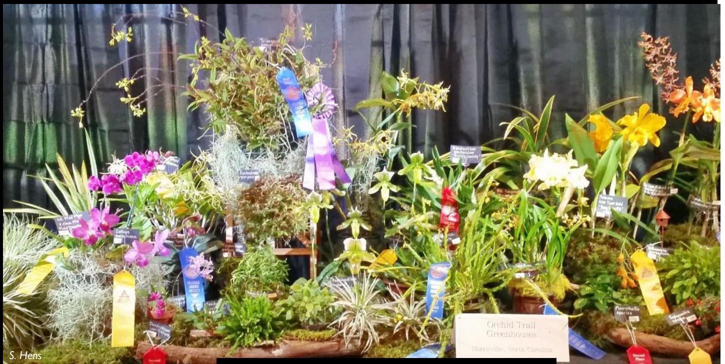
The Orchid Trail