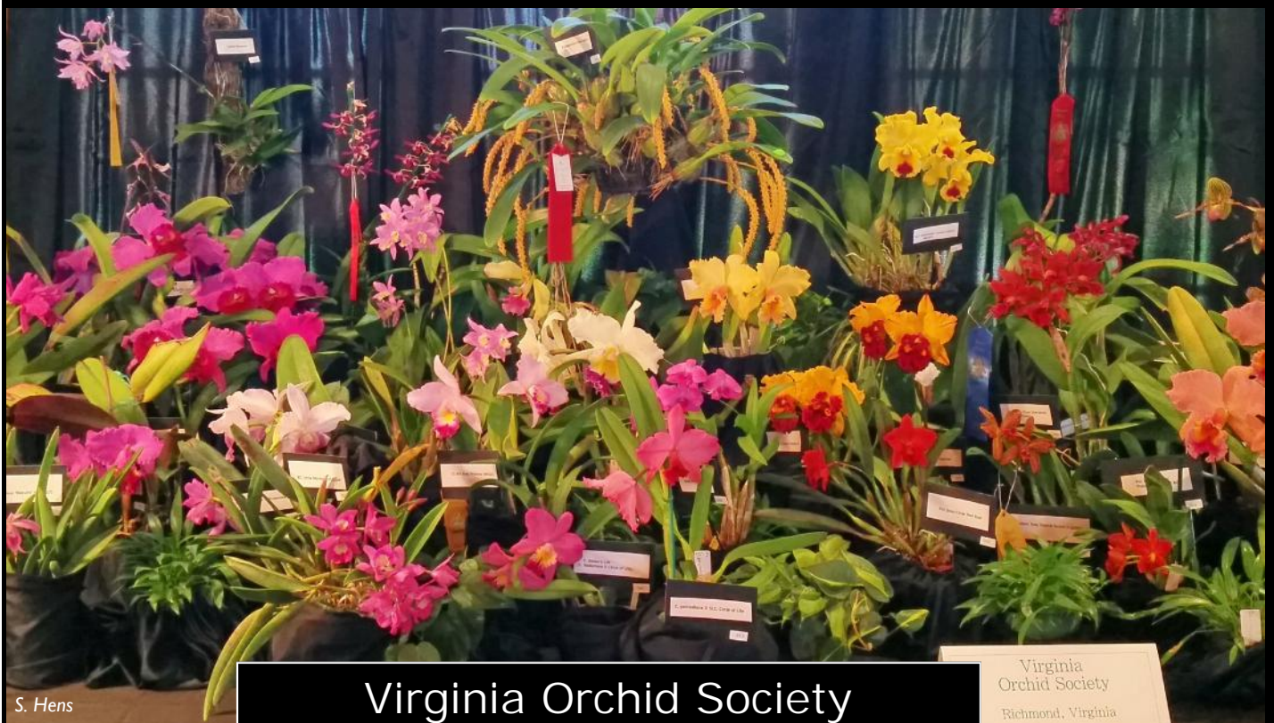
Virginia Orchid Society

Virginia Orchid Society Richmond, Virginia