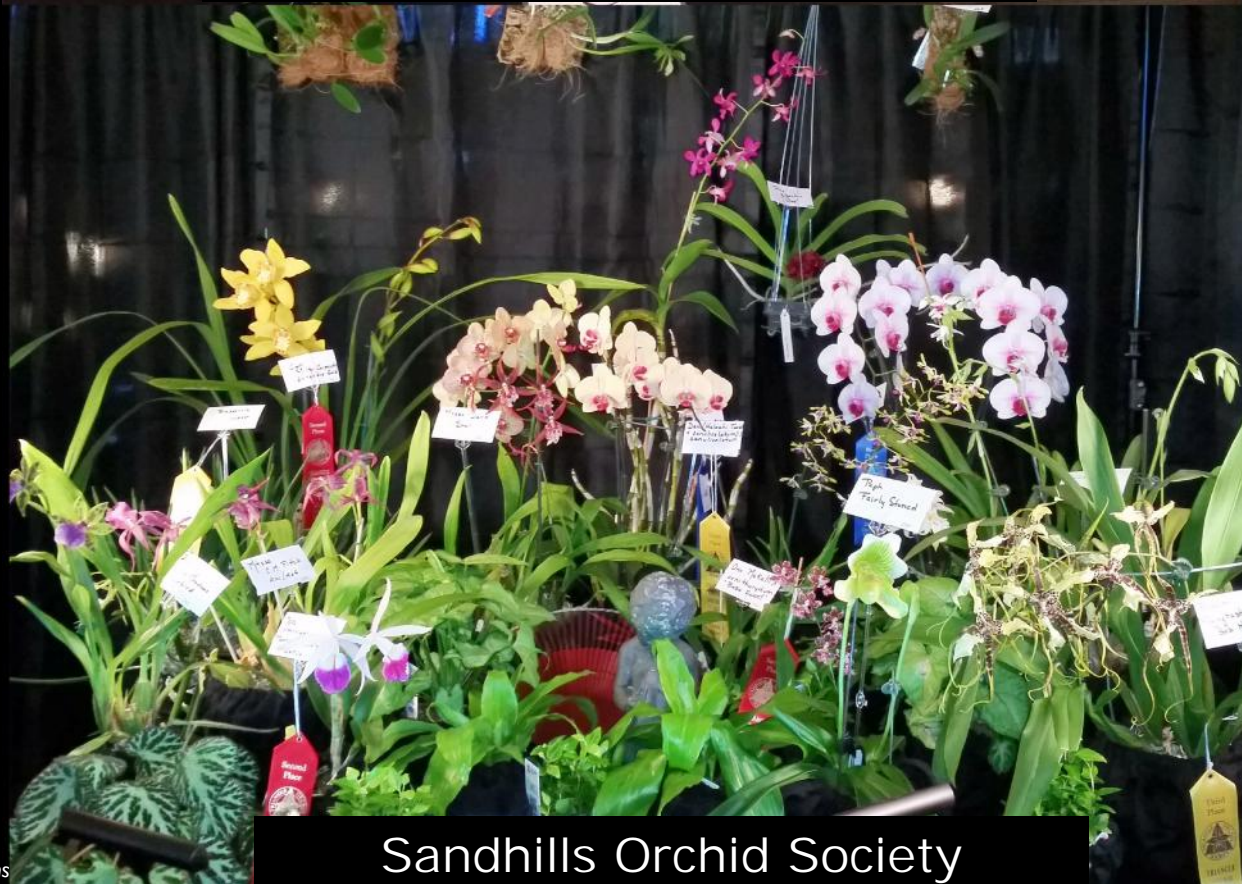
Sandhills Orchid Society