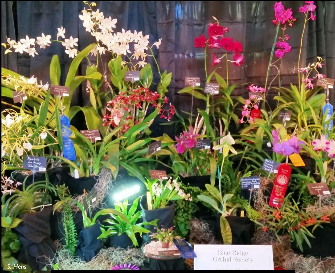
Blue Ridge Orchid Society