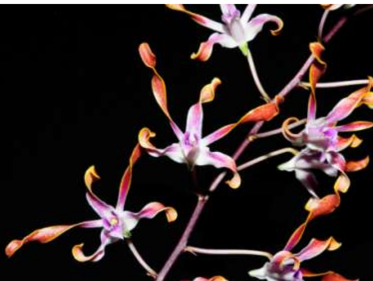
Dendrobium Gloucester Sands 'Alan Miller'