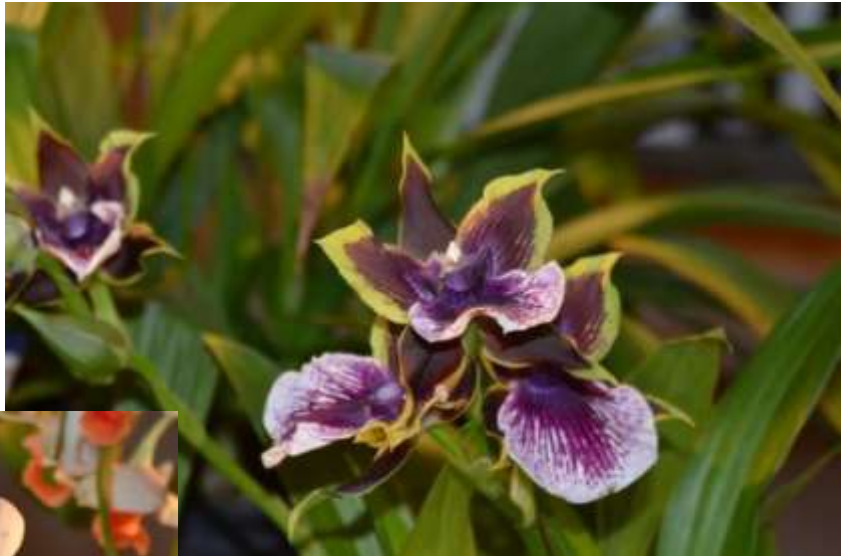
1 st Place: Galeopetalum Giant 'Rhein Moonlight' grown by Ralph Belk