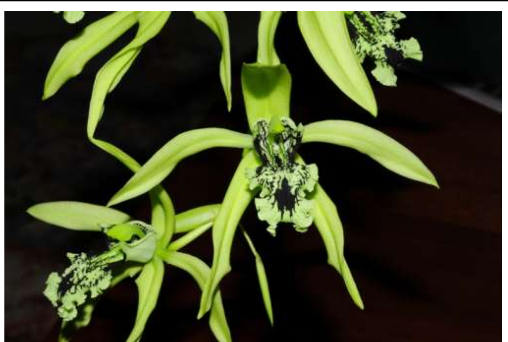
Coelogyne South Carolina