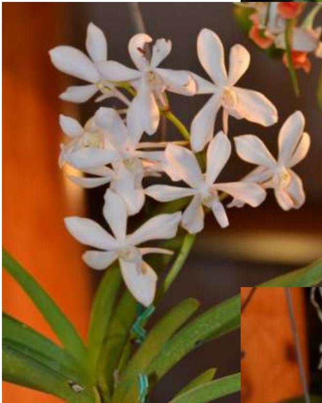
2 nd Place: Vandofinetia 'White Crane' grown by Lee Allgood