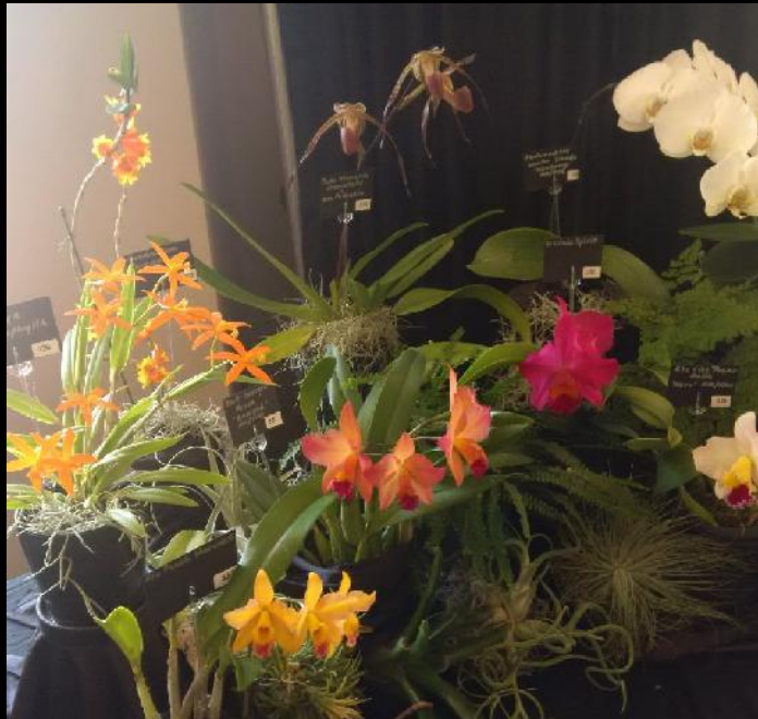
TOS members' plants.