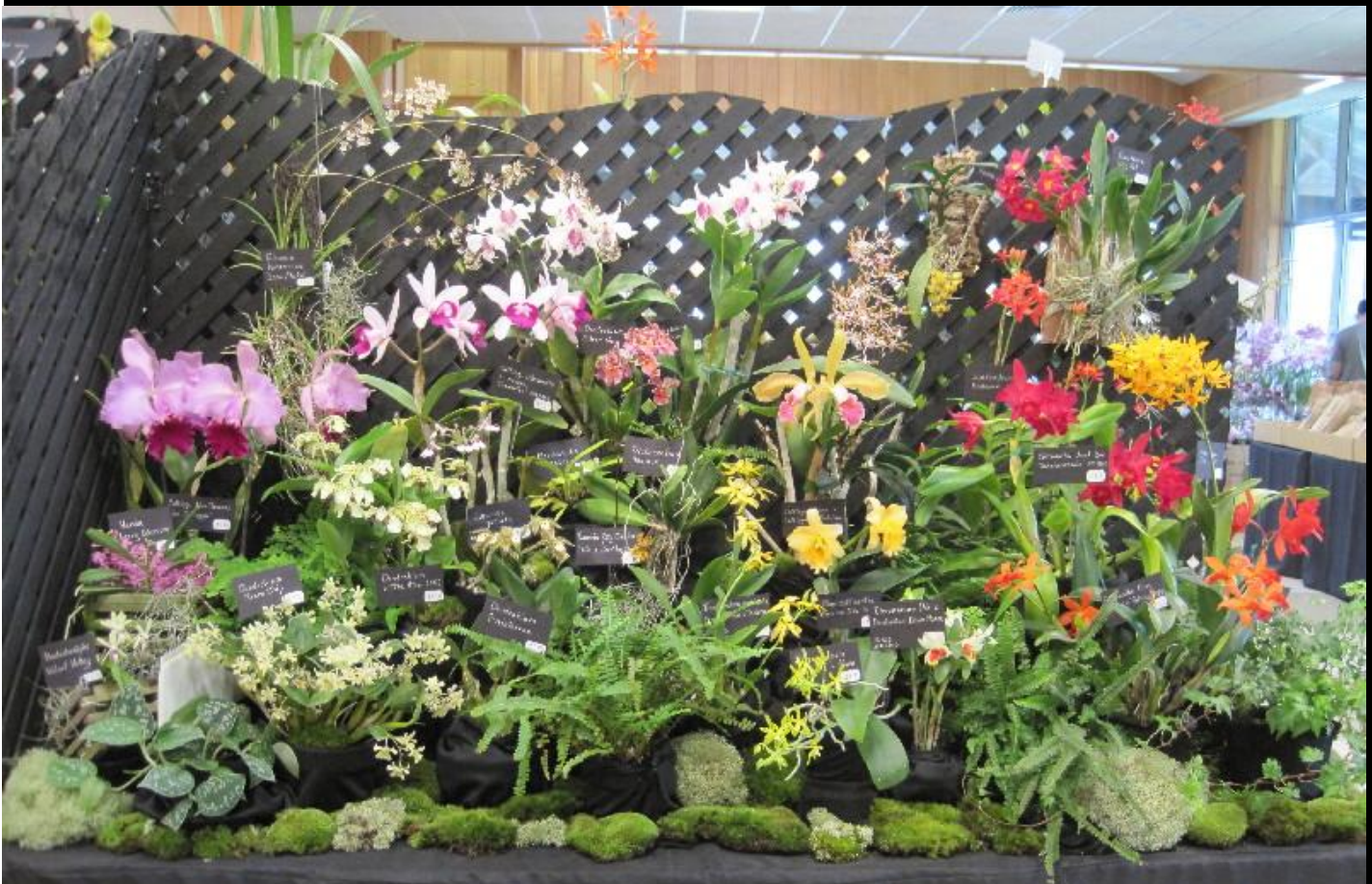
Triangle Orchid Society