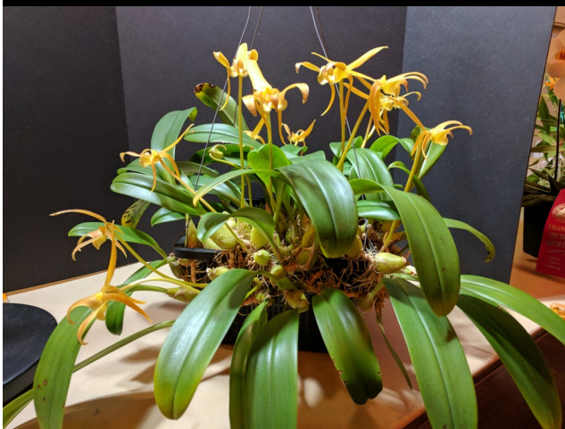
3rd Place (Tie): Bulbophyllum lobbii 'Kathy's Gold' (AM/AOS), grown by Sara Gallis