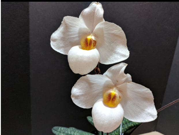
2nd Place: Paphiopedilum Armeni White , grown by Allan Miller