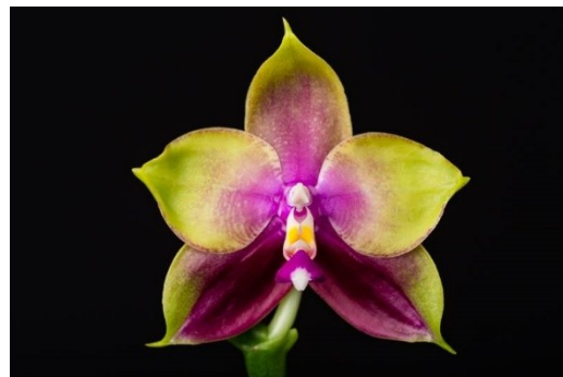
(Left) Phal Mituo Prince 'Marley' AM/AOS, (Right) Phal Mituo King Bellina 'Marley's Ruby' AM/AOS