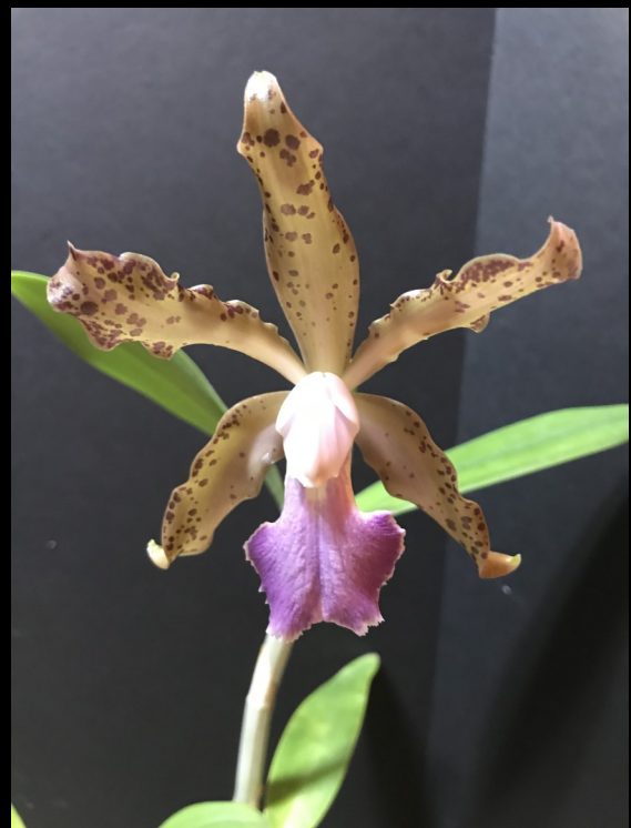
3rd Place: Cattleya Poseidon Lake , grown by Ralph Belk