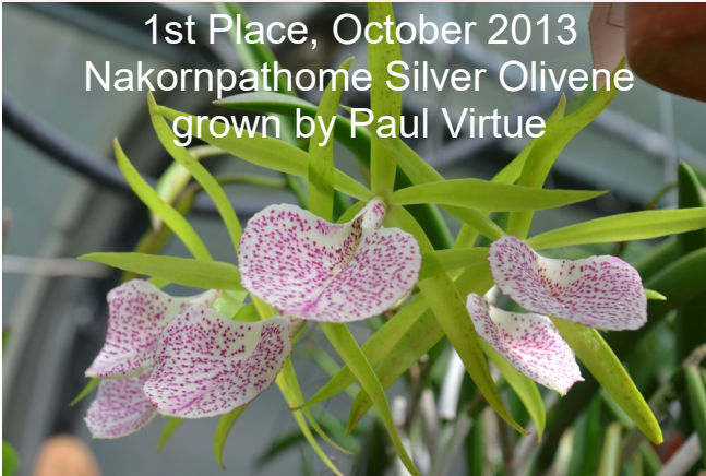
1st Place, October 2013 Nakornpathome Silver Olivene grown by Paul Virtue

800 orchids in total. Orchids that were placed outside for the summer included Paul's high light orchids (mostly Vandas and Cattleyas)